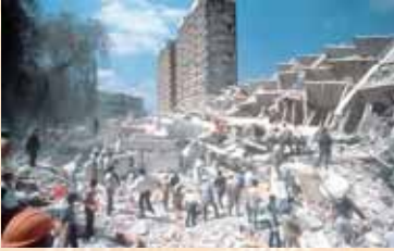
Earthquake in Mexico