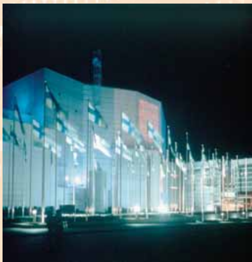
The “Tampere Hall” in Tampere, Finland, where the treaty on Telecommunication for Disaster Mitigation and Relief was signed on 18 June 1998

www.itu.int/itu-d/emergencytelecoms/tampere