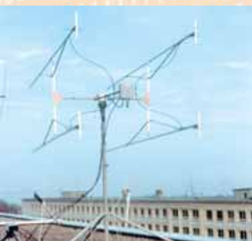
Antenna of an amateur radio station on the ITU building roof in Geneva

The Government of Australia has made a voluntary contribution of CHF 500,000 for the preparation of telecommunication infrastructure rehabilitation plans and general telecommunication plans for an early warning system for the countries affected by the tsunami. This financial contribution will go a long way towards assisting the affected countries in preparing and dealing with future disasters, and will give a significant boost to ITU's seed money of USD 250 000 allocated for the same purpose following the December 2004 earthquake and the subsequent tsunami generated by it.