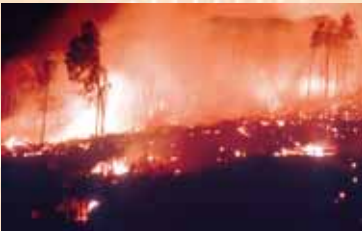
Forest fire in South Africa

Disasters kill at least one million people each decade and leave millions more homeless.