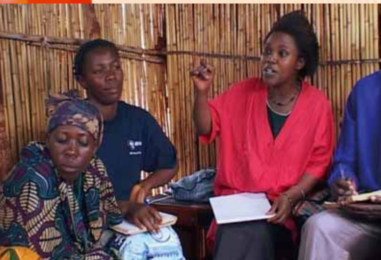
The refugees, including women, have been trained to run the centres themselves

ITU has used various strategies to respond to this need. In many respects, multipurpose community telecentres (MCTs) have been established for the benefit of women, refugees, and other special groups viewed as marginalized.