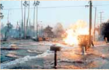
Gas escaping from a broken pipe burns as water from a ruptured main floods a Los Angeles street after an earthquake