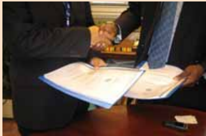
Forging partnerships

Message Heading: ICT Projects for Disaster Mitigation