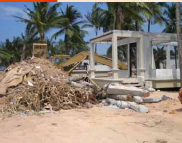
Aftermath of the South East Asia tsunami disaster of Sunday 26 December 2004